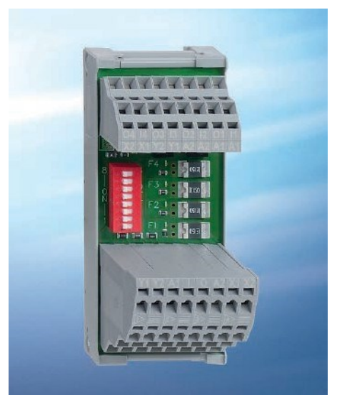
Fig. 2: The PDM passive distributor module is particularly suitable for food and packaging machines.

The basic principle of the installation systems is that the machine constructor does not connect the safety switchgear to the relevant safety controller or the associated safety relay module, but with a separate unit which can be installed in the control cabinet or in the field. There, the signals are bundled together and forwarded to the evaluation unit or to the safety control unit.