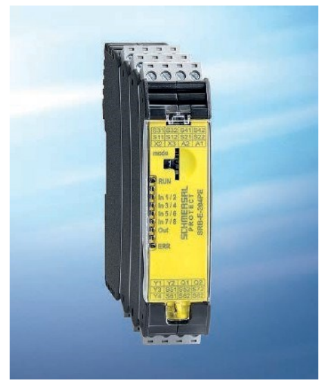
Fig. 4: The active SRB-E input expansions for mechanical safety circuit devices

The passive installation systems include a version with a "Serial Diagnosis" (SD) interface for the serial transfer of non-secure