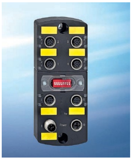
Fig. 3: The PFB passive fieldbox is a plug & play solution in a robust IP67 design.

Passive modules for control cabinet installation and for in the field