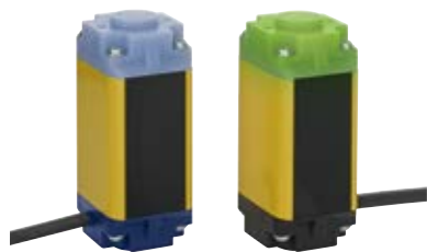
SLB 240 (Type 2)