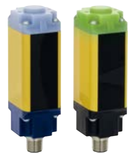
SLB 440-H (Type 4)