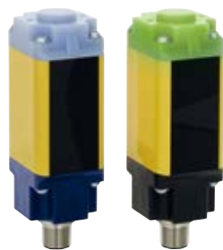
SLB 440 (Type 4)