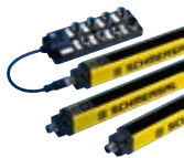
Safety light curtains SLC